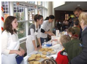
Decorating cookies at Rockside's booth