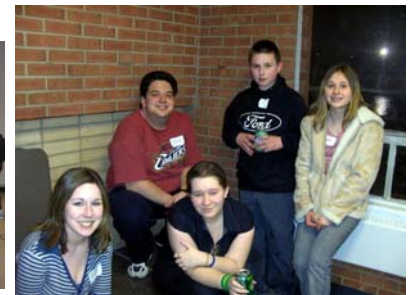
Scenes from several FUSION events